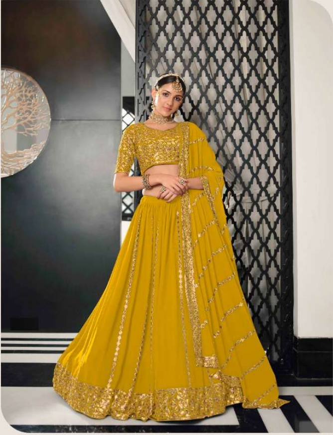
Peeping up bright hues on an eerie palette with a touching of delicate faded motifs – it's just the old traditional charm. #2153