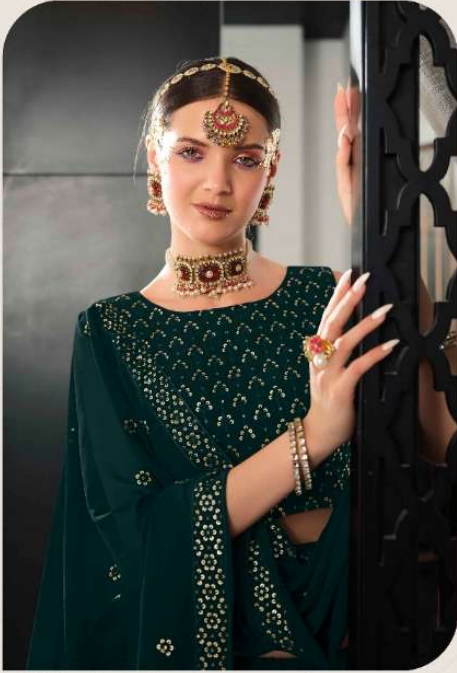
Peeping up bright hues on ammy patola, with a countering of delicate floral motifs – it's just the on traditional charm. #2156