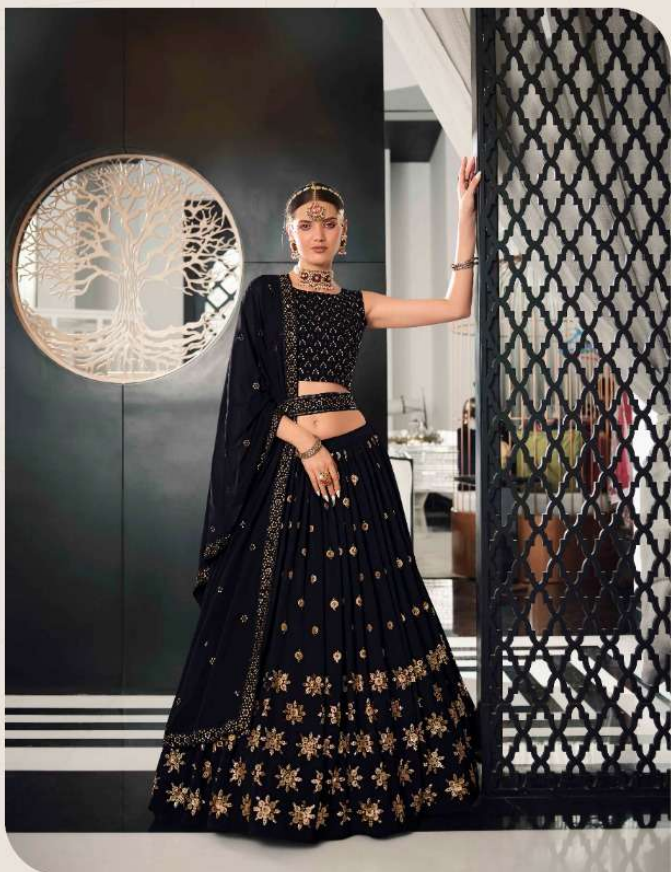
Popping up bright hues as an easy pattern with a maneuvering of delicate floral motifs - it's just the way we did it in this one.