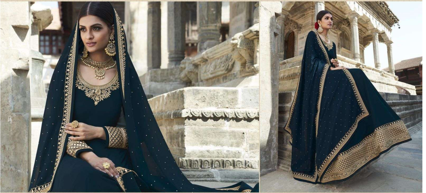
The splendor of Shades ⇄ 22303 ⇄