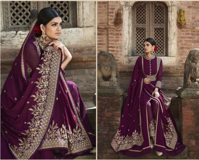
The delicacy of Details ❖ 22302 ❖