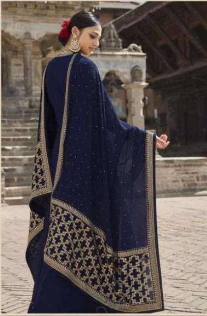
The Tasty of Velvet ❖ 22306 ❖