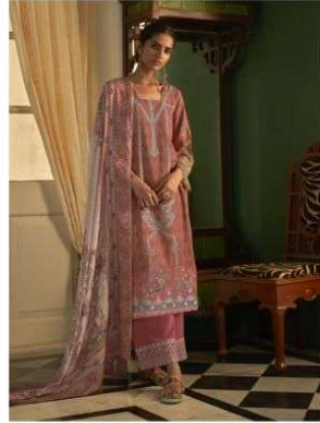
D. No. 8887