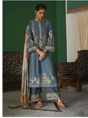
D. No. 8885