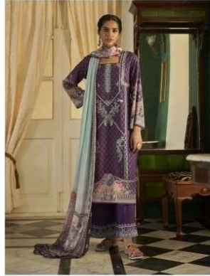
D. No. 8884