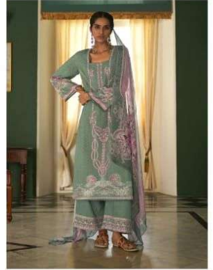
D. No. 8888