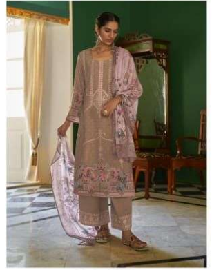
D. No. 8886