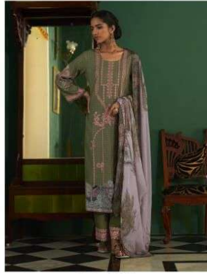
D. No. 8882