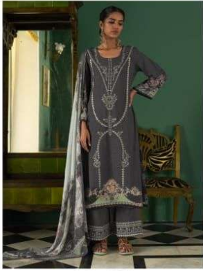
D. No. 8881