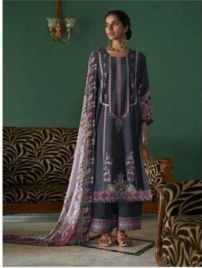
D. No. 8883