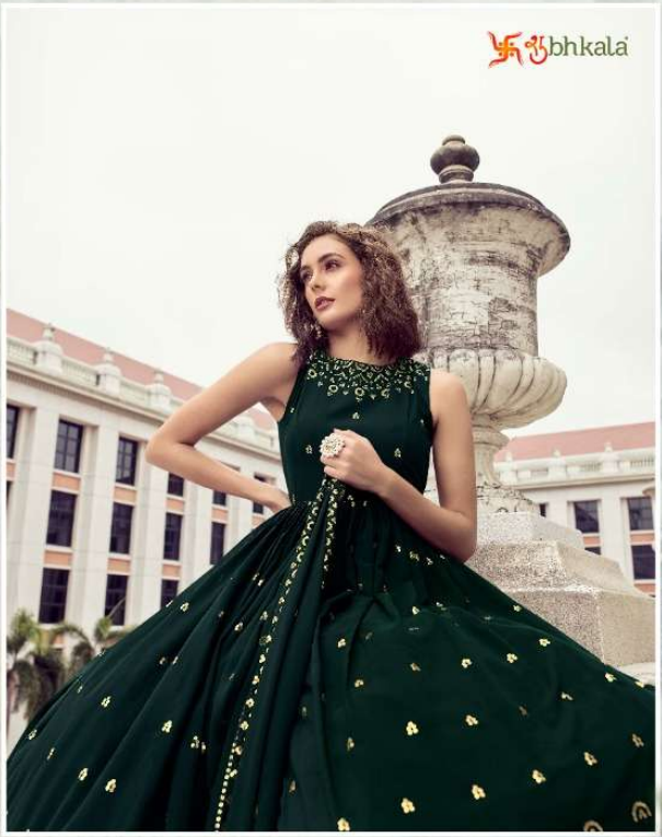
With its richly embroidered bodice and tulle, this gorgeous gown is a perfect balance of feminine elegance.