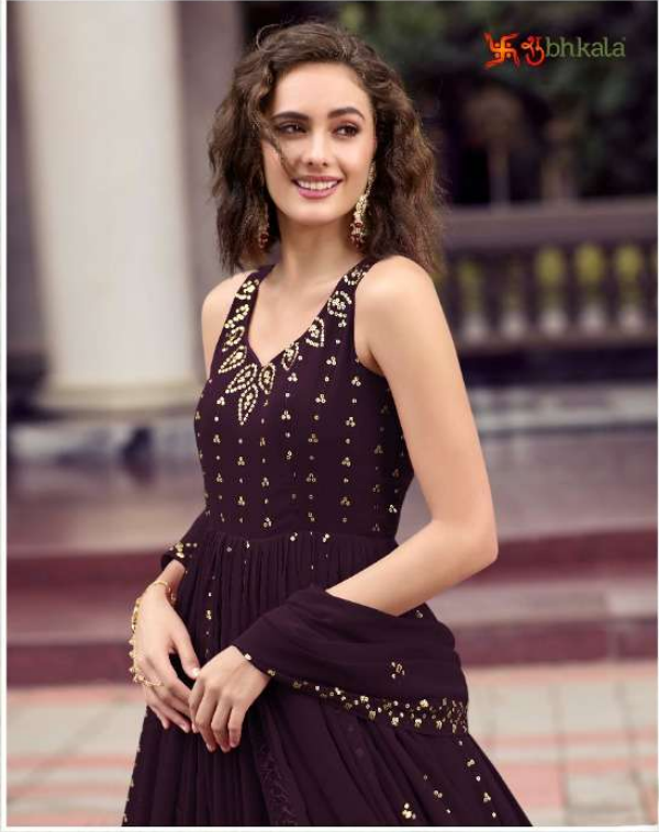
With its richly embroidered bodice and tulle, this gorgeous gown is a perfect balance of feminine and classic.