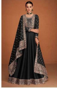
A | 9578