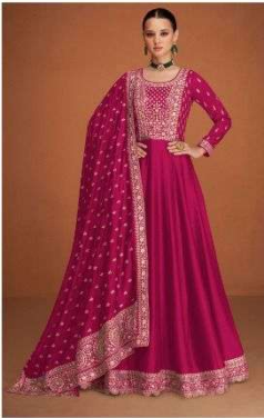
A | 9579