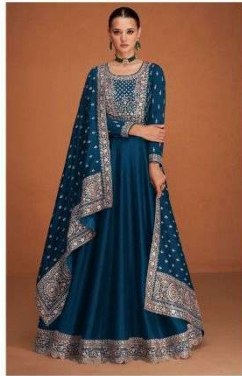
A | 9580