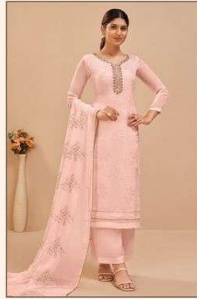
❁ 2045 B ❁