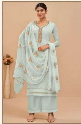
❁ 2046 A ❁