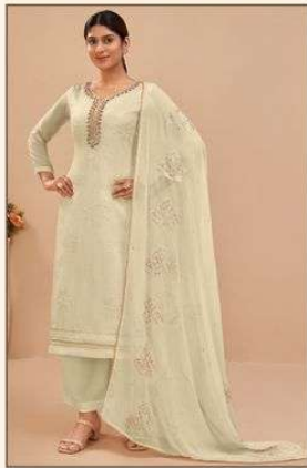
❁ 2045 D ❁