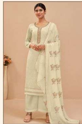
❁ 2046 D ❁