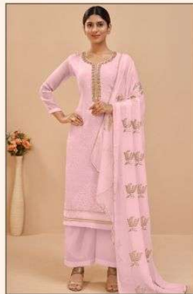
❁ 2046 C ❁