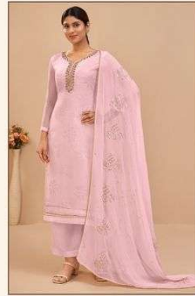
❁ 2045 C ❁