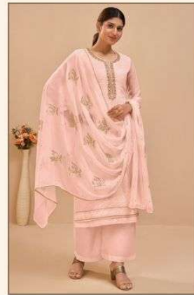
❁ 2046 B ❁