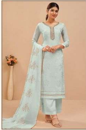
❁ 2045 A ❁