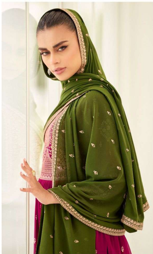
A | - 9659