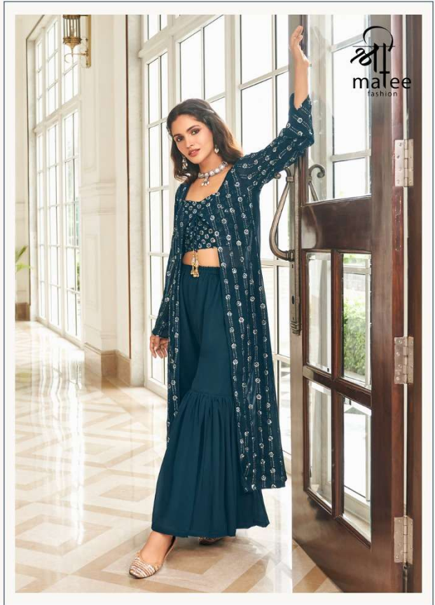
My fashion is about the urban woman in the year. I think about obscure, weird things and try to create a world around them