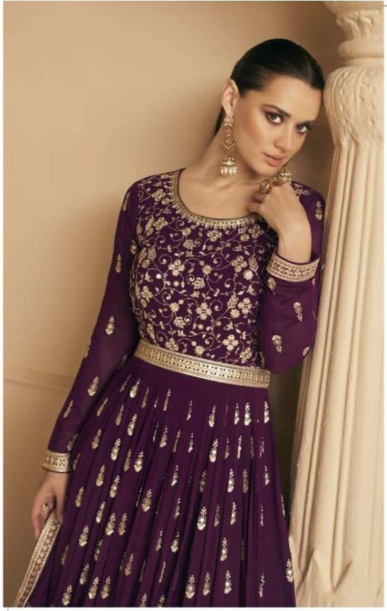
A - 9655