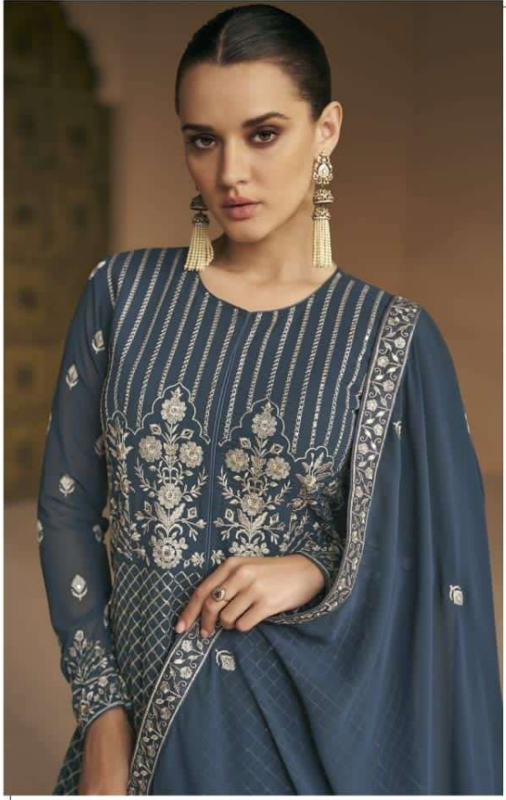
A - 9656