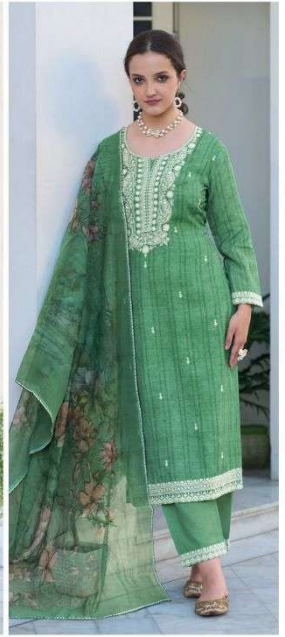
→ 1182 ←