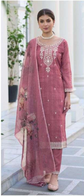
→ 1179 ←