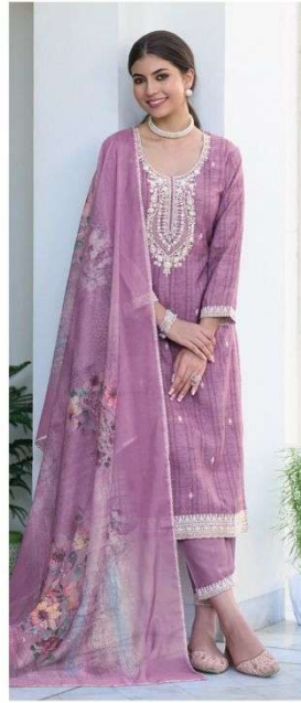
→ 1181 ←