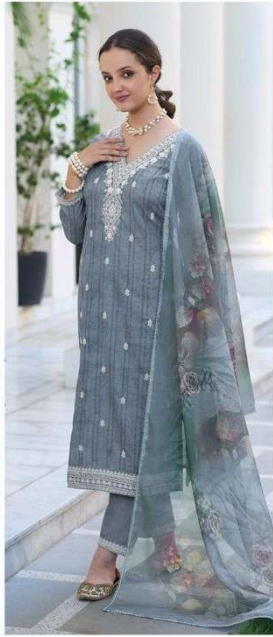
→ 1180 ←