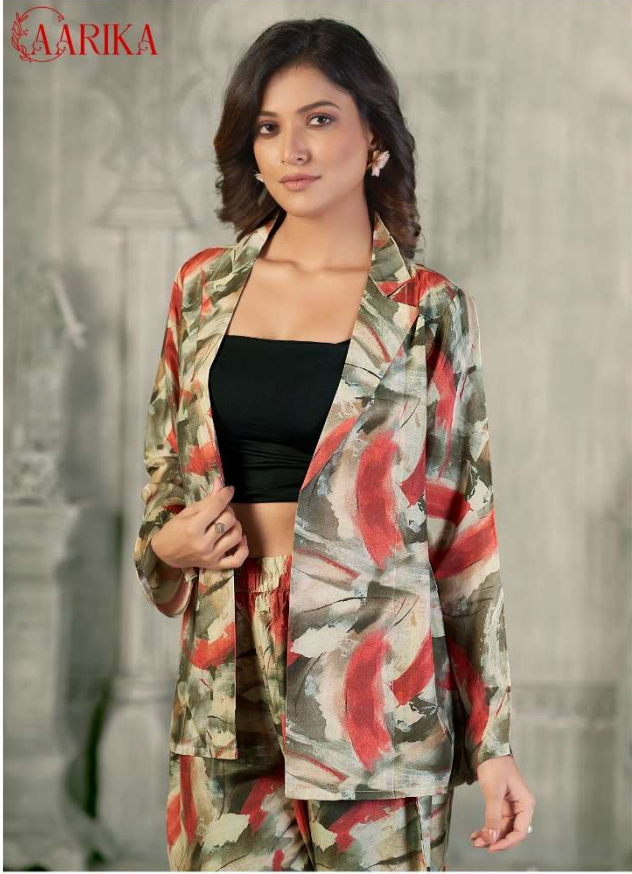
D.No:4913 Fashion you can buy, but style you possess. The key to style is learning who you are, which takes years. There's no how-to road map to style. It's about self-expression and, above all, attitude.