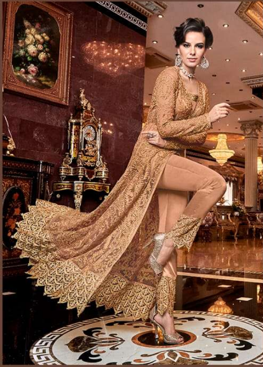
D.NO :- 6308-B