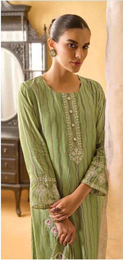
8773 SUMMER COLLECTION 2022