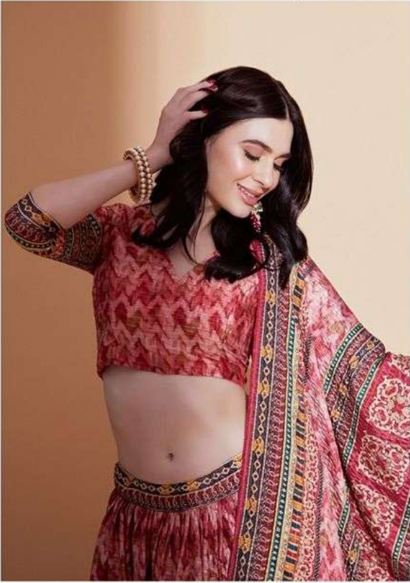
LOVE YOUR STYLE 2106