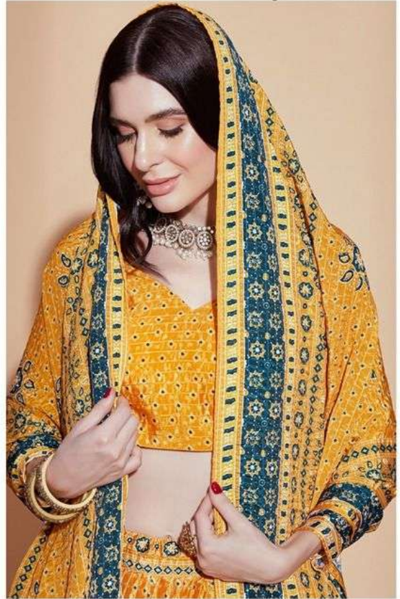
YOU'NAMI US SP'CIAL 2107