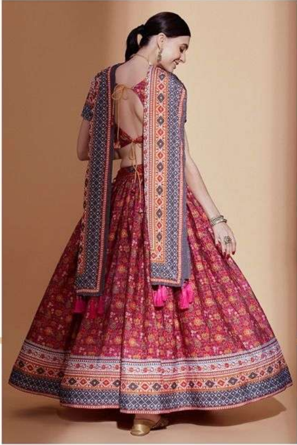
HEY WAH WITH YOUR STYLE