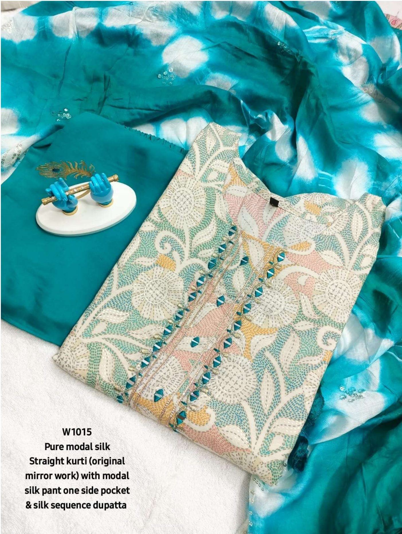
W1015 Pure modal silk Straight kurti (original mirror work) with modal silk pant one side pocket & silk sequance dupatta