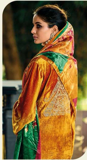
A girl should be two things : classy and fabulous .....