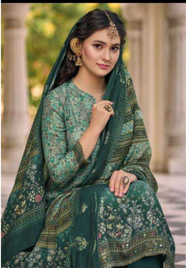
The traditional BRIDE