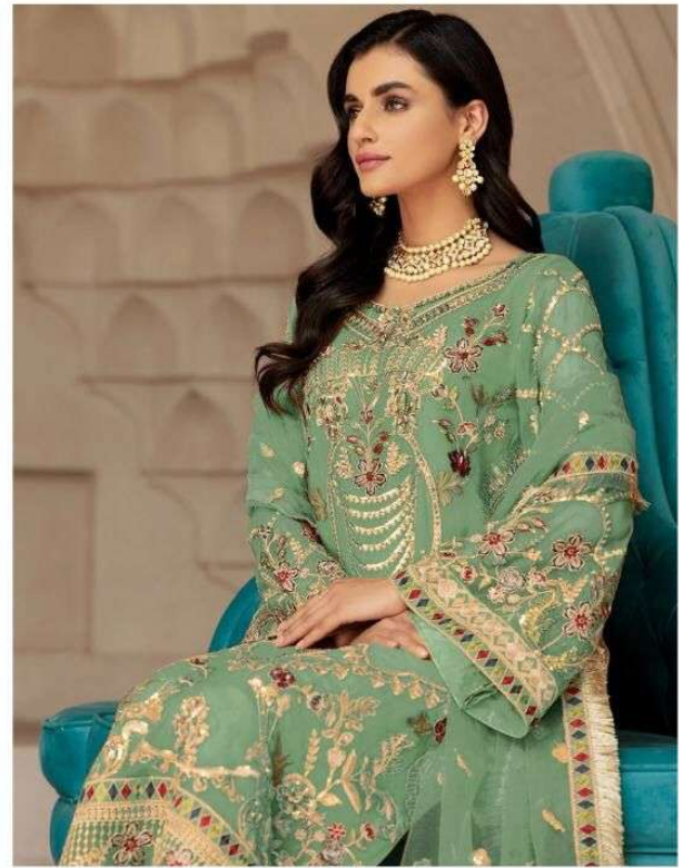
D.NO.130-B TOP:- GEORGETTE INNER:- SANTOON BOTTOM:- SANTOON DUPATTA:- NET