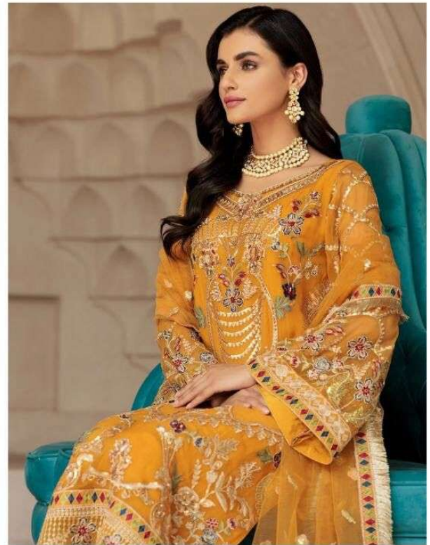
D.NO.130 TOP:- GEORGETTE INNER:- SANTOON BOTTOM:- SANTOON DUPATTA:- NET