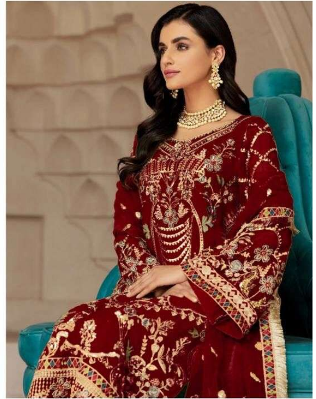
D.NO.130-E TOP:- GEORGETTE INNER:- SANTOON BOTTOM:- SANTOON+ PATCHWORK DUPATTA:- NAZNEEN