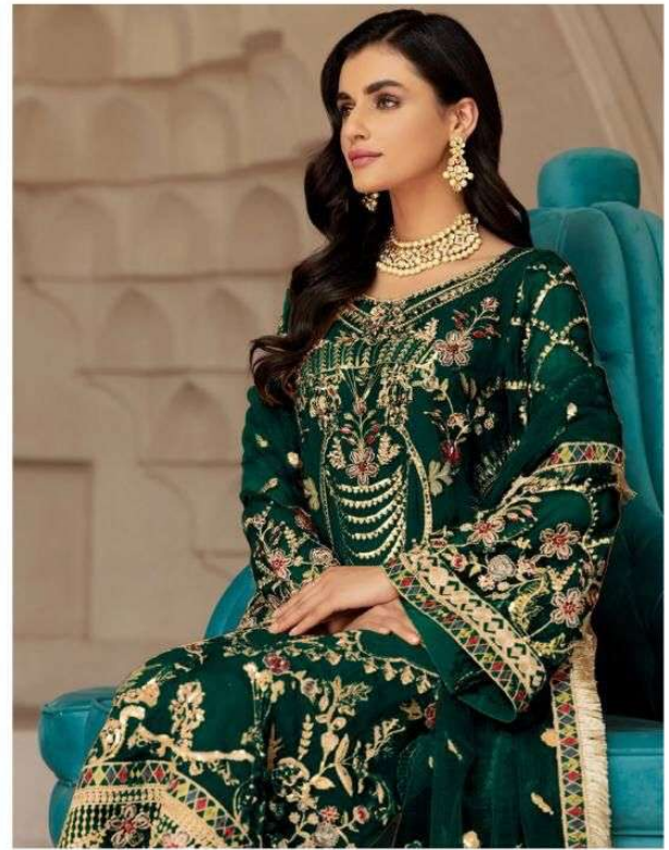
D.NO.130-A TOP:- GEORGETTE INNER:- SANTOON BOTTOM:- SANTOON+ PATCHWORK DUPATTA:- NAZNEEN