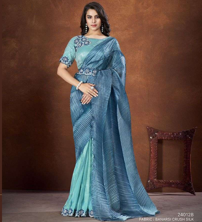
24012B FABRIC : BANARSI CRUSH SILK SEMI READY-TO-WEAR BLOUSE ACCESSORIES WITH: A DESIGNER BELT