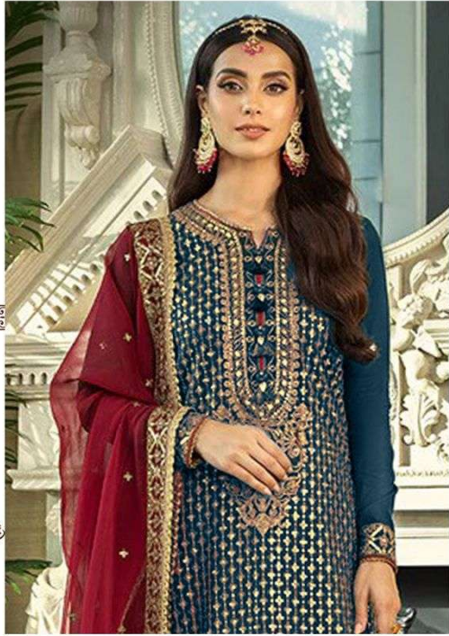
D.NO.174 - B

TOP - GEORGETTE WITH EMBROIDERY SEQUENCES WORK BOTTOM - DULL SANTOON DUPATTA - GEORGETTE WITH EMBROIDERY WORK INEER - DULL SANTOON