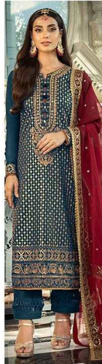
D.NO.174 - B