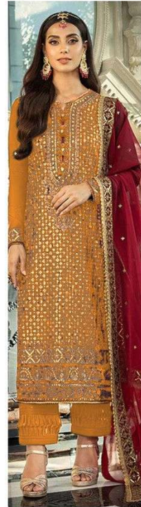
D.NO.174 - C