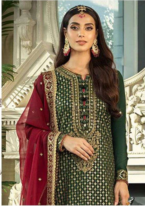
D.NO.174 - A

TOP - GEORGETTE WITH EMBROIDERY SEQUENCES WORK BOTTOM - DULL SANTOON DUPATTA - GEORGETTE WITH EMBROIDERY WORK INEER - DULL SANTOON