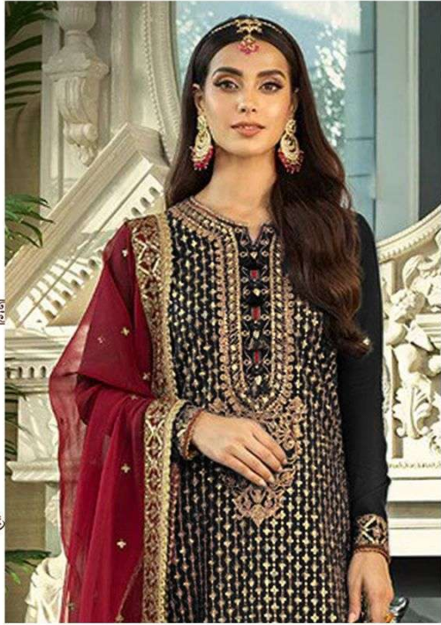
D.NO.174 - D

TOP - GEORGETTE WITH EMBROIDERY SEQUENCES WORK BOTTOM - DULL SANTOON DUPATTA - GEORGETTE WITH EMBROIDERY WORK INEER - DULL SANTOON