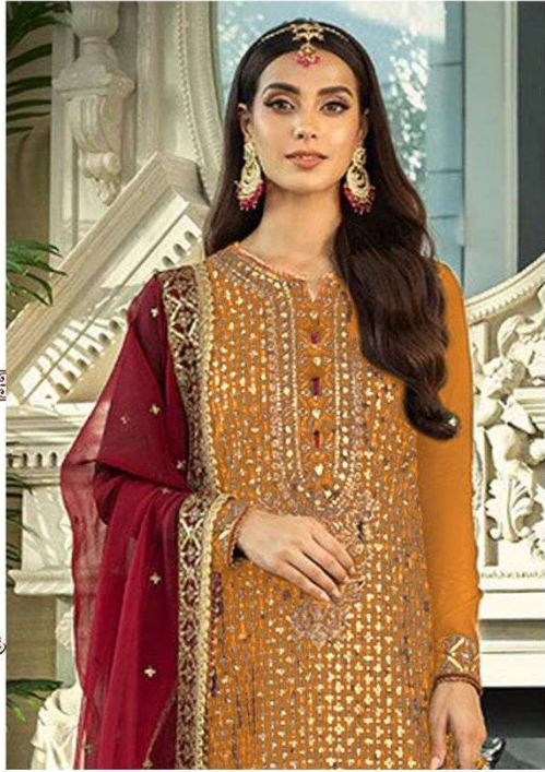
D.NO.174 - C

TOP - GEORGETTE WITH EMBROIDERY SEQUENCES WORK BOTTOM - DULL SANTOON DUPATTA - GEORGETTE WITH EMBROIDERY WORK INEER - DULL SANTOON