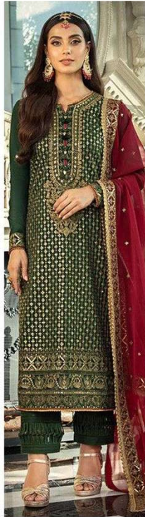
D.NO.174 - A