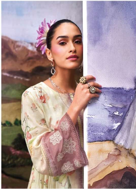
A great photograph is one that fully expresses what one feels, in the deepest sense, about what is being photographed.