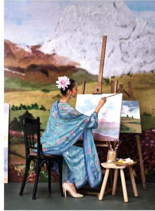
A great photograph is one that fully expresses what one feels, in the deepest sense, about what is being photographed.