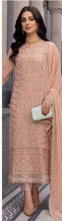
D.NO.161 - A

TOP :- FOX GEORGETTE EMBROIDERY SEQUINS WORK BOTTOM:- SANTOON INNER :- SANTOON DUPTTA :- FOX GEORGETTE EMBROIDERY SEQUINS WORK