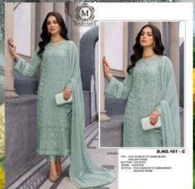
D.NO. 161 - C TOP - 100% COTTON WITH EMBROIDERY OF SILK SKIRT - 100% COTTON WITH EMBROIDERY OF SILK BUST - 34 INCHES LENGTH - 58 INCHES © 2015. ALL RIGHTS RESERVED TO MARYAM'S DRESSING HOUSE