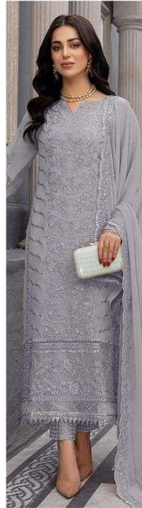
D.NO.161 - B