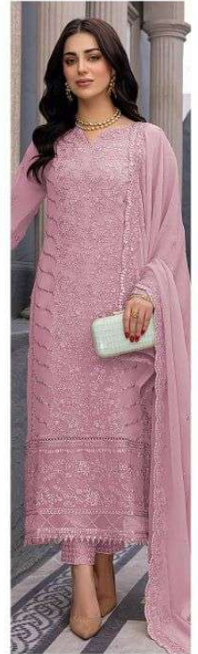
D.NO.161 - D