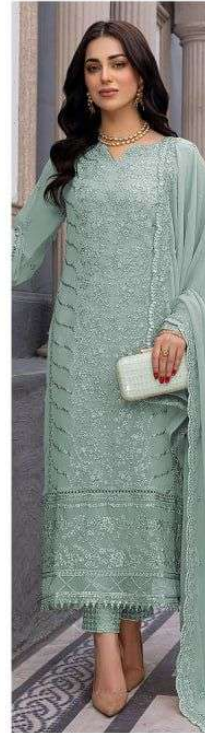
D.NO.161 - C