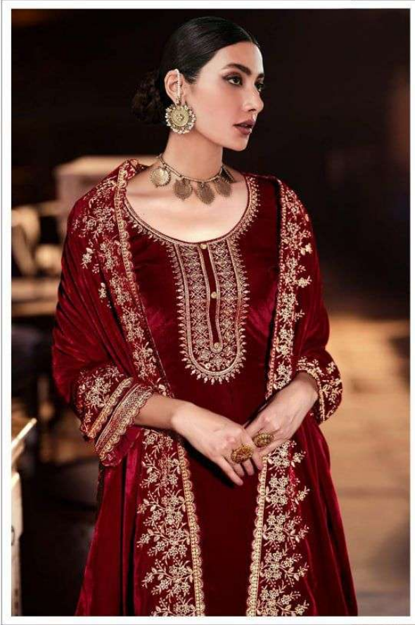
D.NO.160 - A

TOP :- VELVET DUPATTA :- VELVET BOTTOM :- VELVET WORK :- JARI SEQUENCE