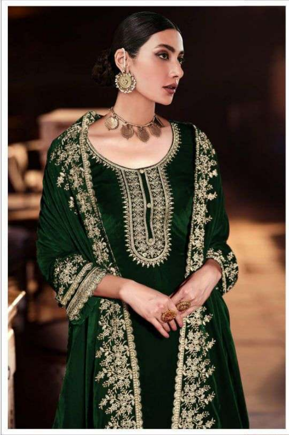
D.NO.160 - B

TOP :- VELVET DUPATTA :- VELVET BOTTOM :- VELVET WORK :- JARI SEQUENCE