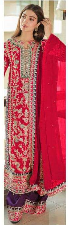
D.NO.180 - D