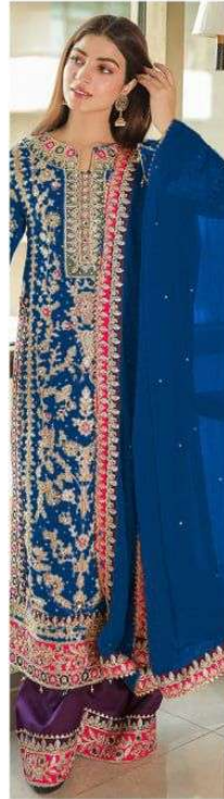
D.NO.180 - B