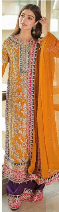
D.NO.180 - A