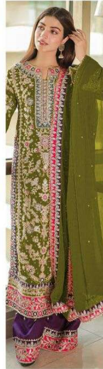
D.NO.180 - C