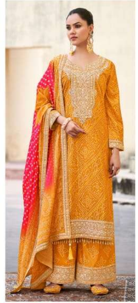
SHRINGAR | 3024