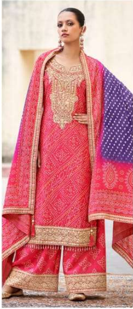
SHRINGAR | 3021