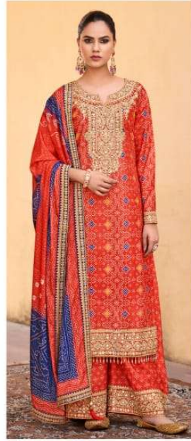
SHRINGAR | 3023