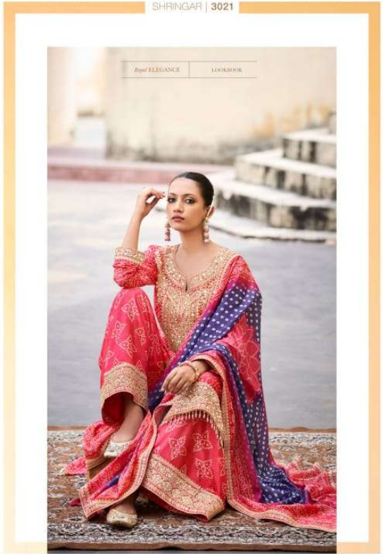
Crafted with the latest designs and AMAZING COLOR combinations, THIS COLLECTION will make you fall for it.