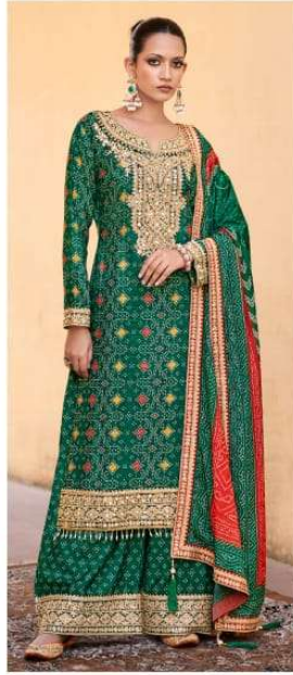
SHRINGAR | 3022