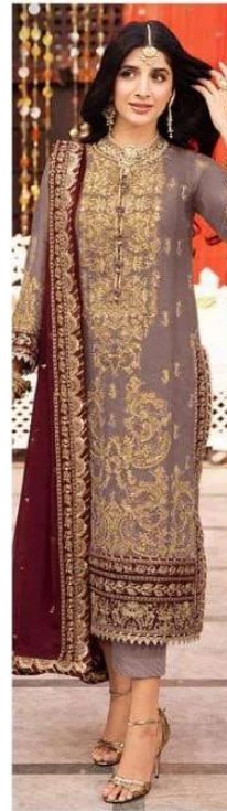
D.NO.179 - B