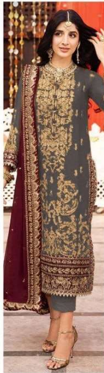
D.NO.179 - A