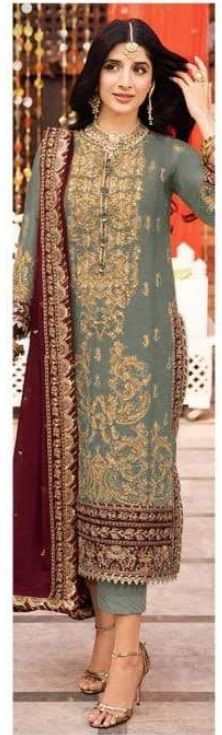
D.NO.179 - D