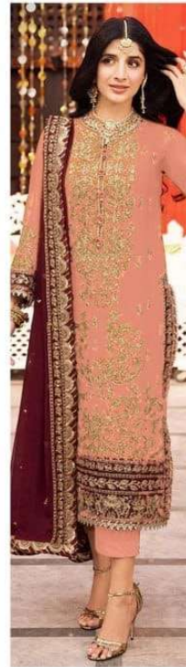
D.NO.179 - C