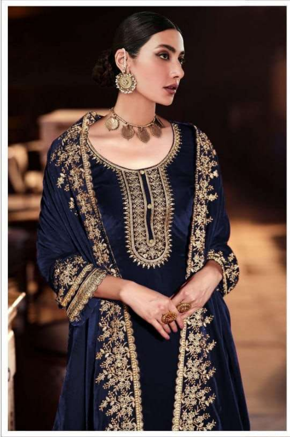
D.NO.160 - D

TOP :- VELVET DUPATTA :- VELVET BOTTOM :- VELVET WORK :- JARI SEQUENCE