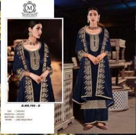
D.NO.160 - D TOP - VELVET DUPPIYA - VELVET MATERIAL - VELVET WORK - ZARI EMBROIDERY