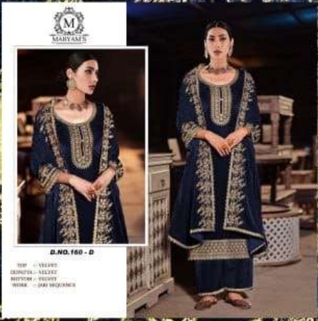
D.NO.160 - D TOP : VELVET SKIRT/PANTS : VELVET MATERIAL : VELVET WORK : ZARI EMBROIDERY