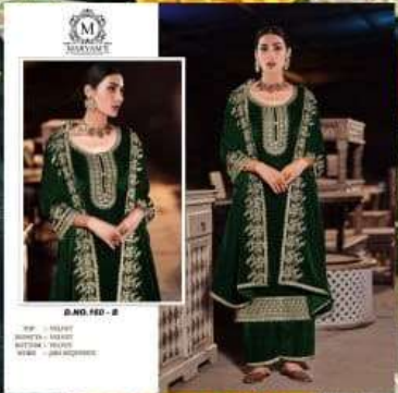
D.NO. FFD - 8 MATERIAL - VELVET CUTTING - FULLY WORK - 100% HANDMADE