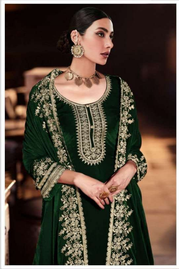
D.NO.160 - B

TOP :- VELVET DUPATTA :- VELVET BOTTOM :- VELVET WORK :- JARI SEQUENCE