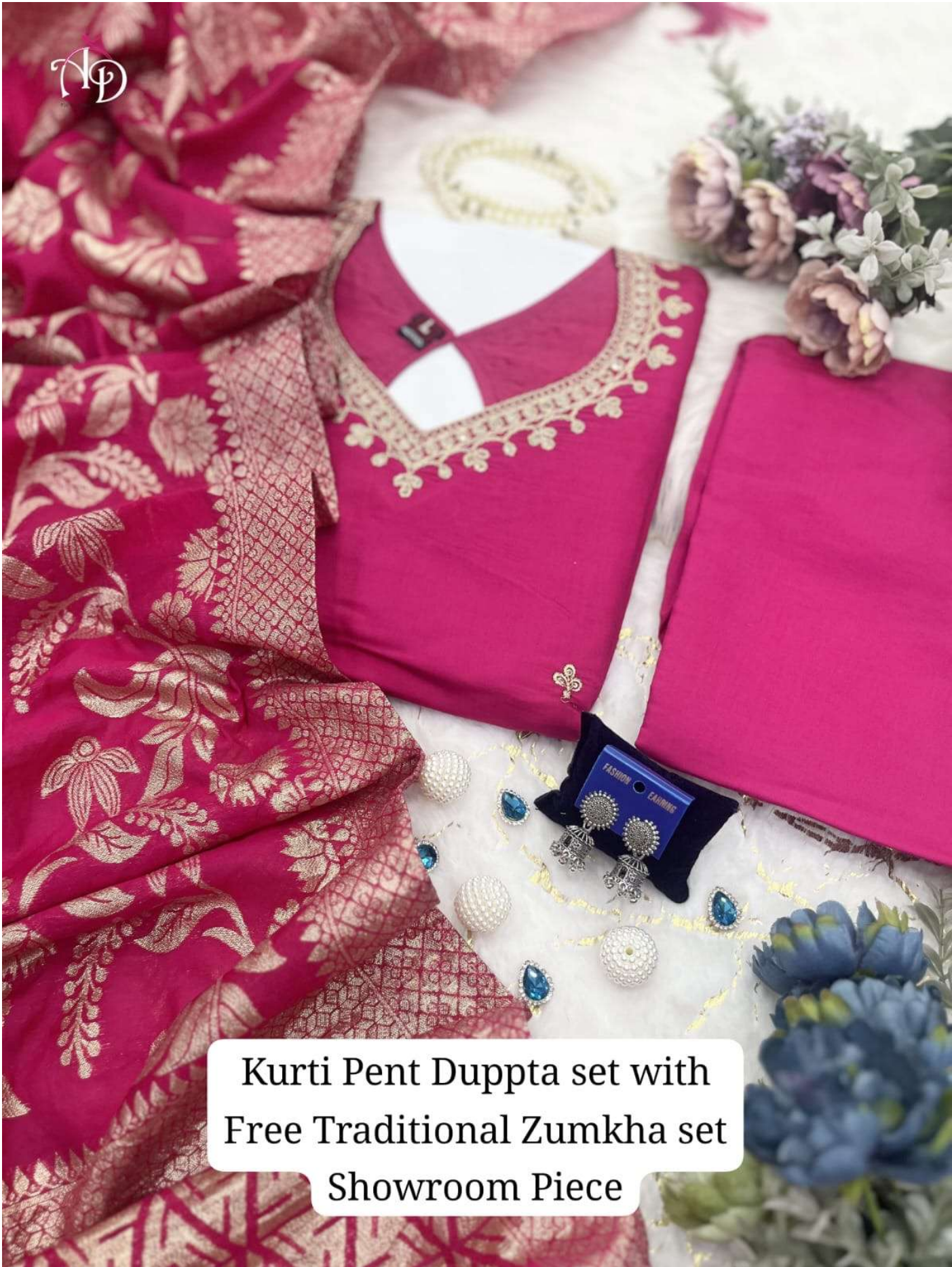
Kurti Pant Duppta set with Free Traditional Zumkha set Showroom Piece