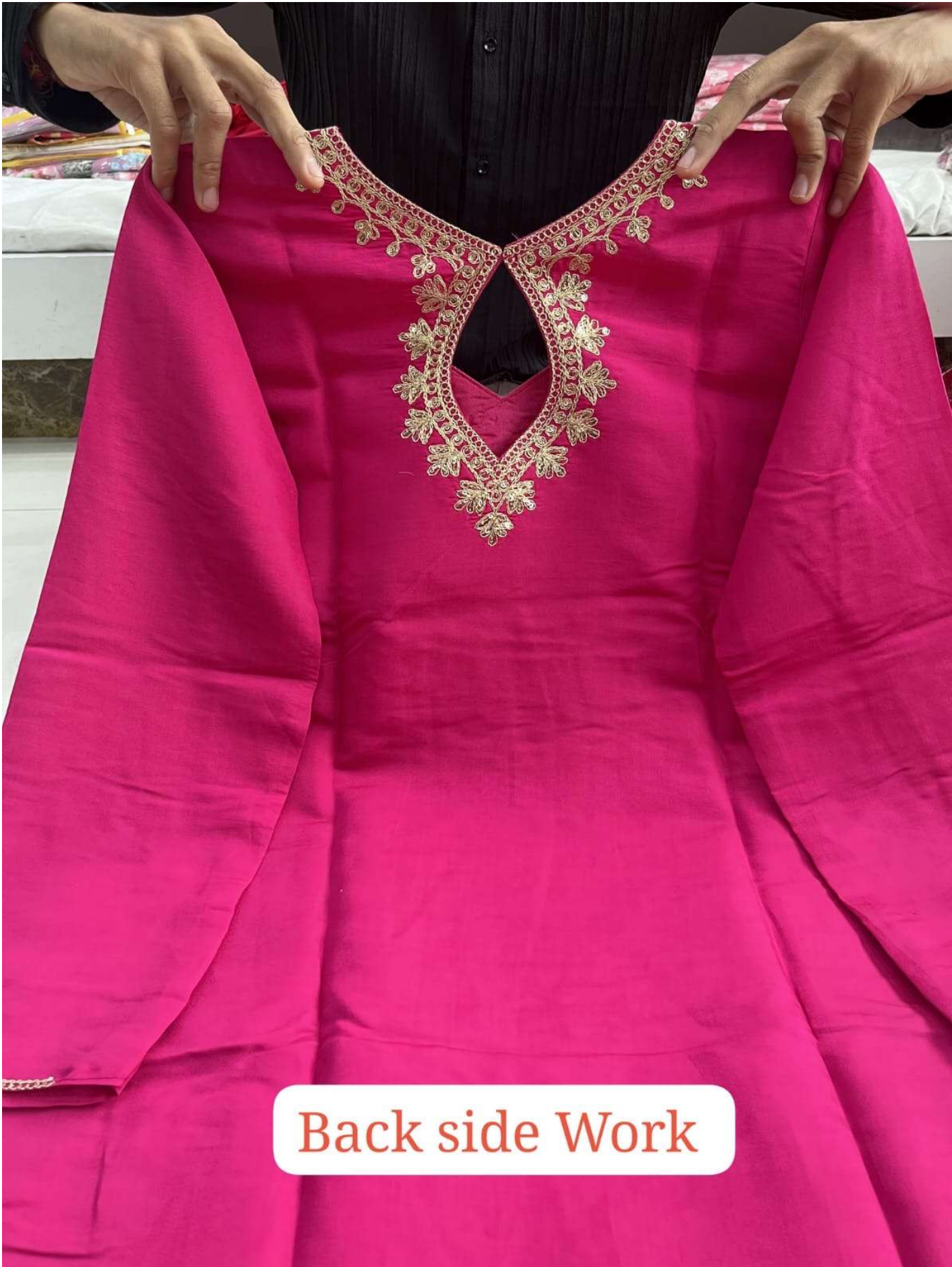
Back side Work