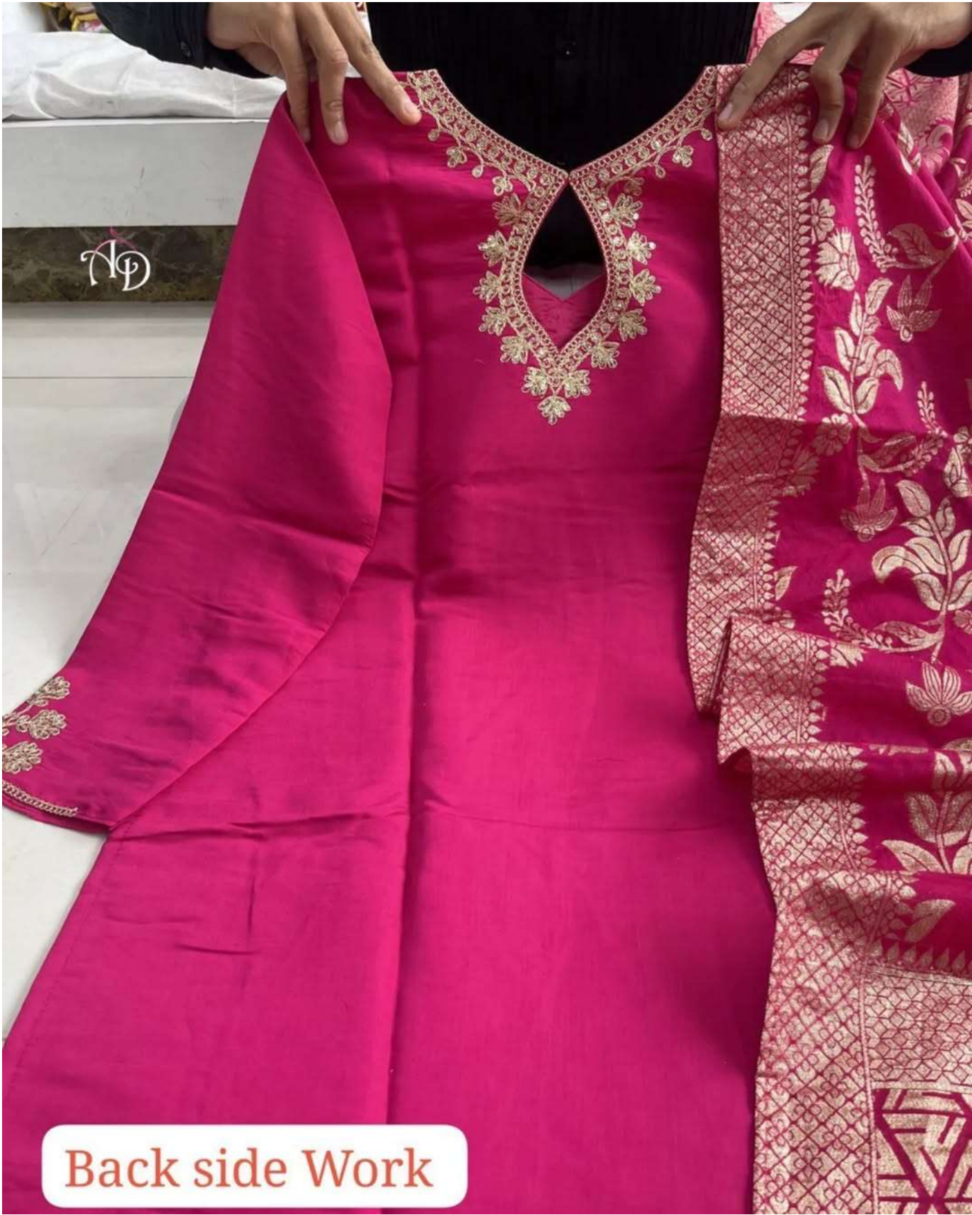
Back side Work