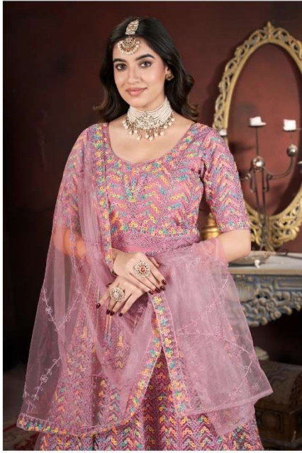
Rare, Eloquent and Alluring, a rich heritage of Indian craftsmanship and tradition unfolds in the new form of lehenga.