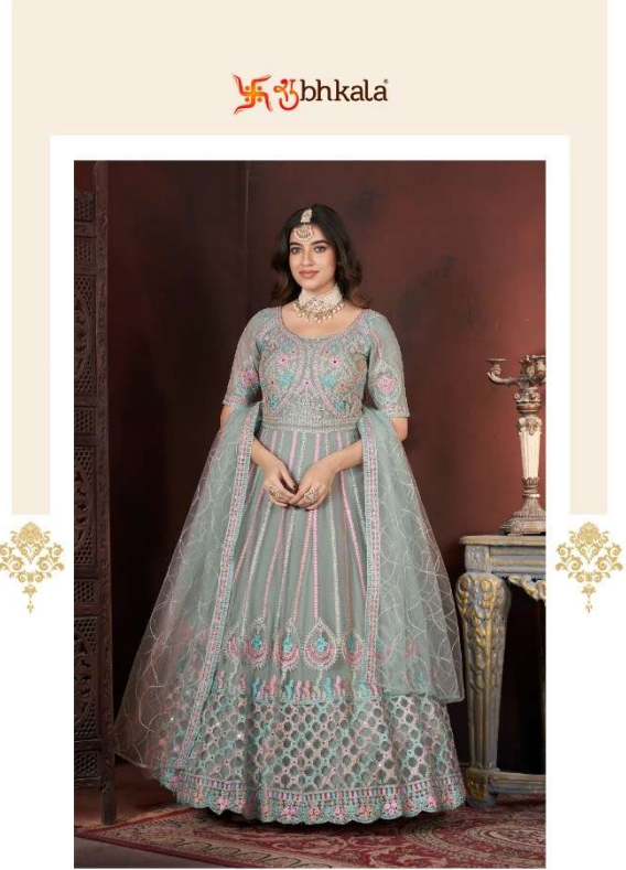
Rare, Eloquent and Alluring, a rich heritage of Indian craftsmanship and tradition unfolds in the new form of lehenga.