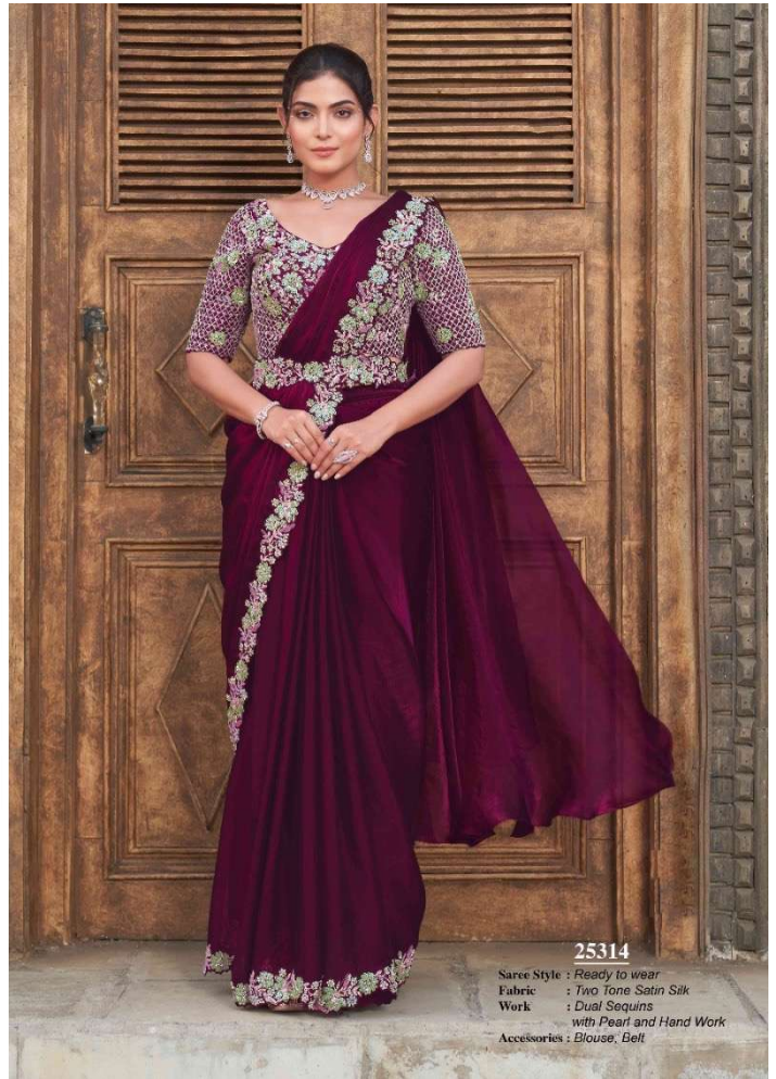
25314 Saree Style : Ready to wear Fabric : Two Tone Satin Silk Work : Dual Sequins with Pearl and Hand Work Accessories : Blouse, Belt